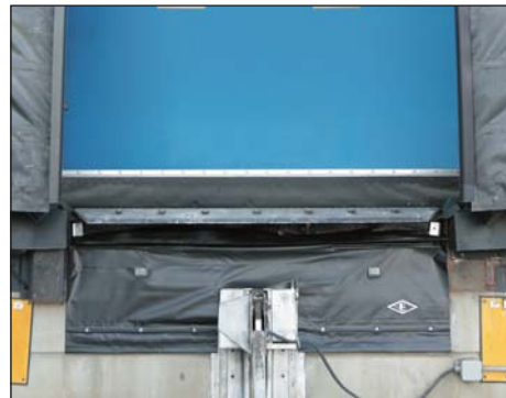
Pit sealed with PitMaster.