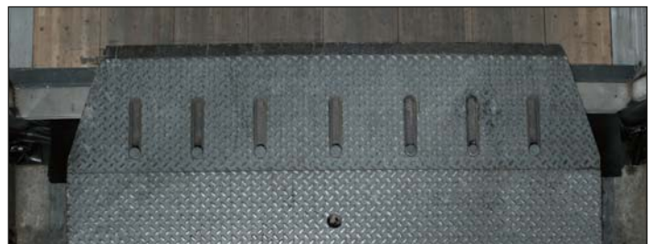
With PitMaster and optional lip corner seals.

The same view shows how air gaps and "white space" have been effectively closed.