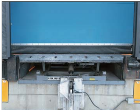
Open leveler pit without PitMaster.

You're already investing in a dock seal or shelter to control the environmental conditions at your dock doors. Why stop at sealing only three sides of the opening? Complete the job by sealing the fourth side with PitMaster™, the industry's only pit-sealing under-leveler seal.